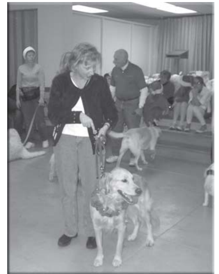
Berks County Dog Training Club's therapy dogs visit OH at Christmas.

With this, of course, comes expense. The cost to house an adult in our men's dorm is approximately $15 to $18 per day. The cost to run the entire shelter program is over half a million dollars a year. Sometimes it's just hard to realize the cost to heat a huge building, provide showers for so many people, laundry facilities and meals.