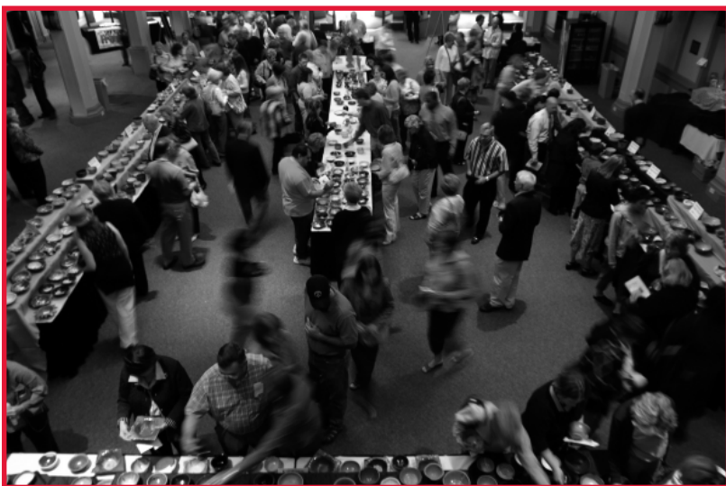
Reading Eagle photo from the 2007 event.

Highlights for the 6th Annual Souper Bowl